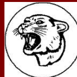
Langley Middle School PTSA